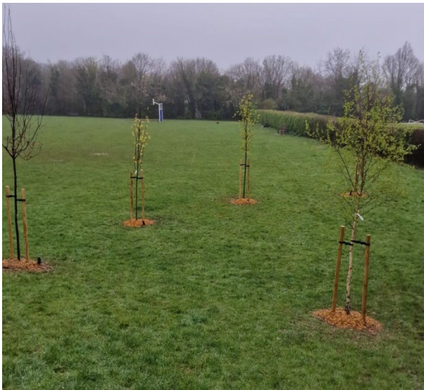
Figure 1 – Tree planting undertaken in Taddington Wood