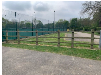
Location 5. Banner. To side of All weather