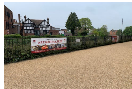
Location 4. Castle side of Watergate