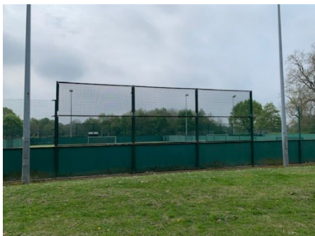
Location 3. Banner. All weather pitch main road side