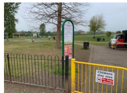
Location 7. Notice board. Entrance to play area, main path near kiosk