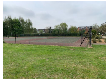
Location 4. Banner. Tennis courts