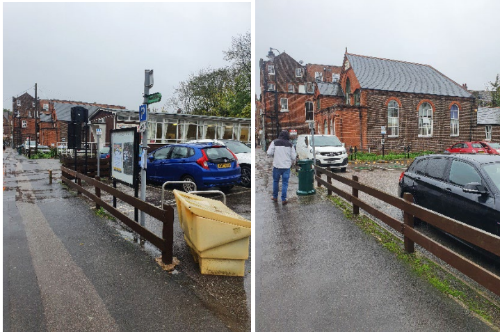
Location 1&2 Banner By noticeboard along road opposite Job Centre.