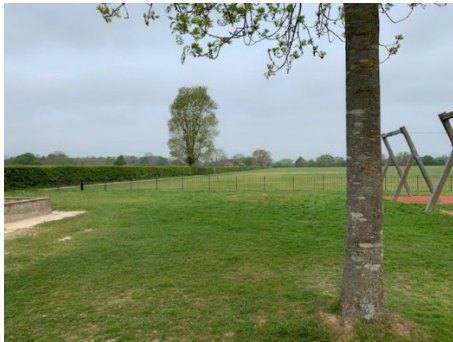
Location 2 Banners. Fencing to rear of play area