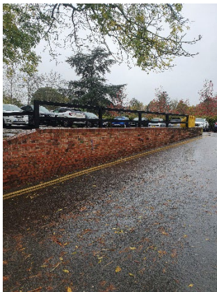
Location 3. Banner Rails between the lower and upper sections of Bradford Street car park.