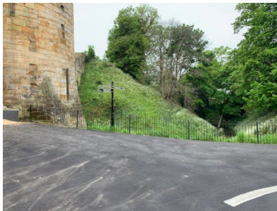
Location 1. Entrance to Castle Gatehouse