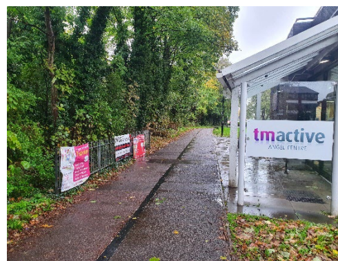
Location. Banner Walkway by Angel Centre.