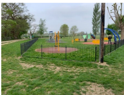
Location 6. Banner. Play area fencing opposite Avebury Avenue bridge