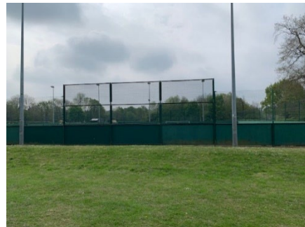
Location 4. Banner. All weather pitch main road side