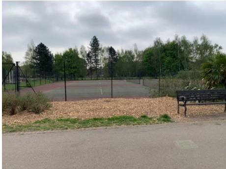
Location 8. Banner. Tennis courts