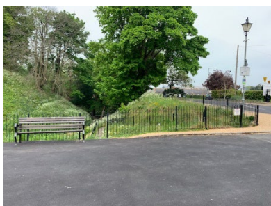
Location 2. To right of Castle gatehouse