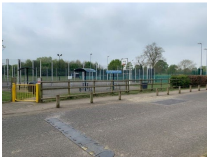
Location 1. Banner. Play area entrance by ball court