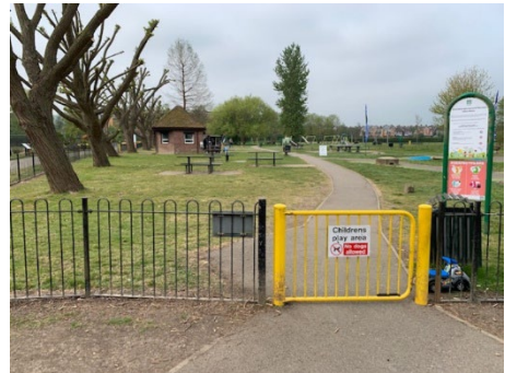
Location 9. Notice Board. Entrance to play area nearest toilets.