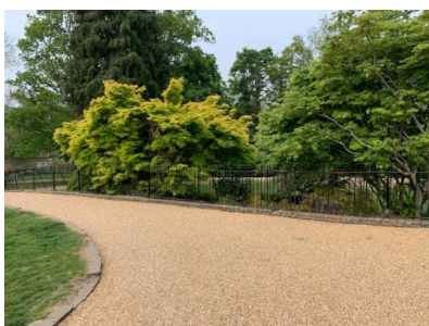
Location 3. Path from the castle lawn to Barons walk/River