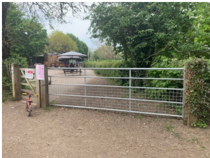
Location 2. Banner Catering/picnic area