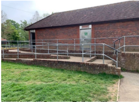
Location 1 . Banner. Toilet railings