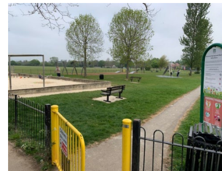
Location 5. Entrance