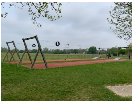
Location 3 Fencing to rear of play area