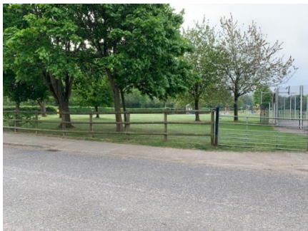
Location 2. Banner. Play area entrance by ball court