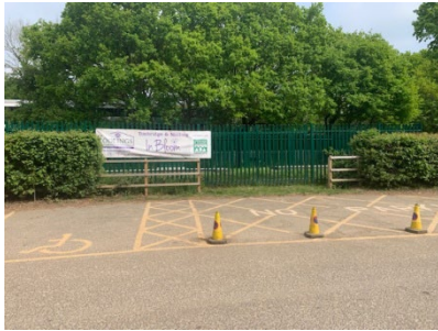
Location 1. Banner Sewage works fencing