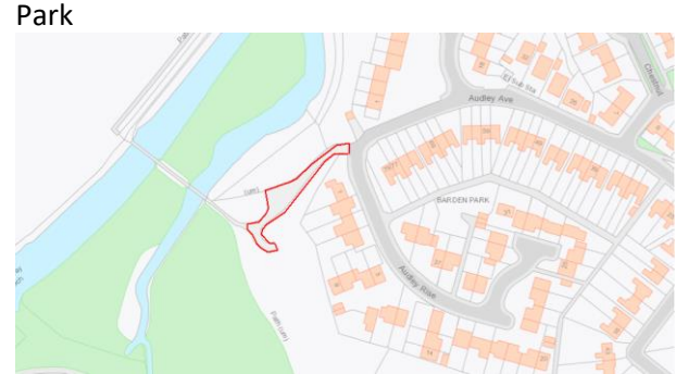
Map above showing dogs on lead area within Audley Rise Car Park