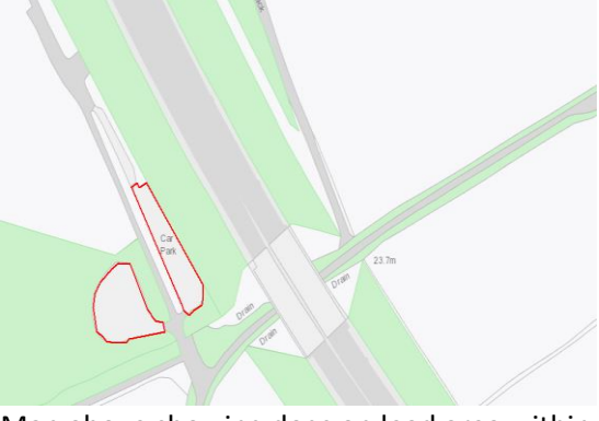
Map above showing dogs on lead area within Lower Haysden Lane Car Park