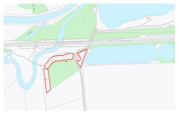
Map above showing dogs on lead area within main car park and catering area within Haysden Country

No person may camp in any place within the Country Park unless specifically authorised in writing by the Council.