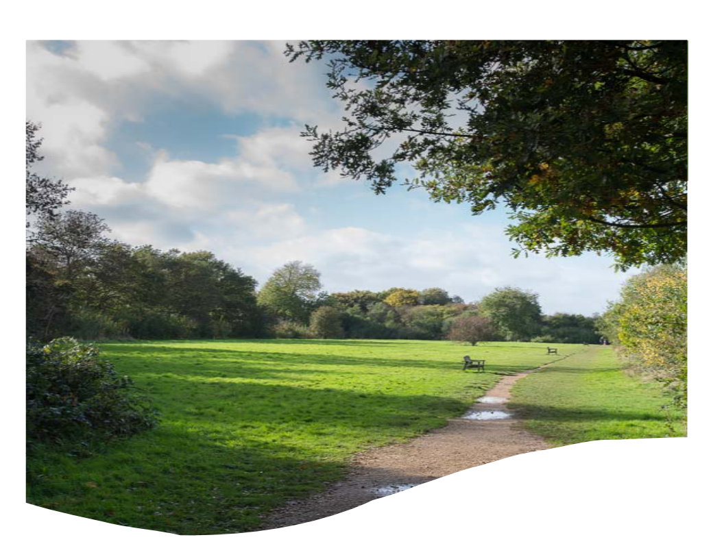
Explore the park searching for wildlife and plants