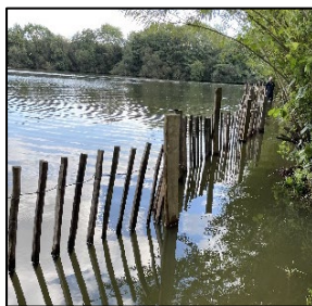
Reed bed planting